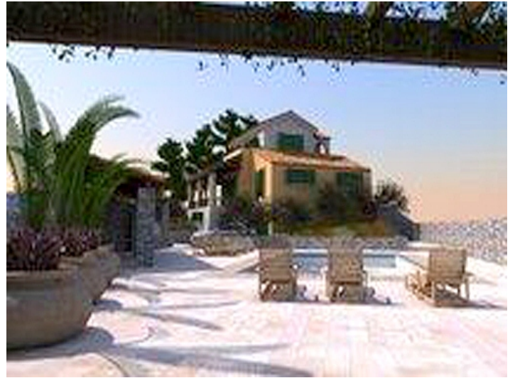
Beautiful Villa with pool and seaview