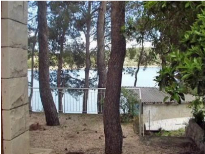
Surrounded by pine trees