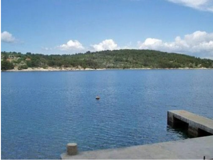
Great sea view