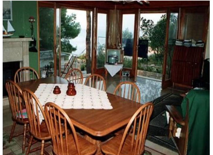
Cozy living room