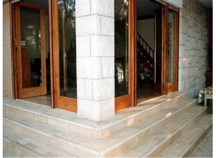
Door to the terrace