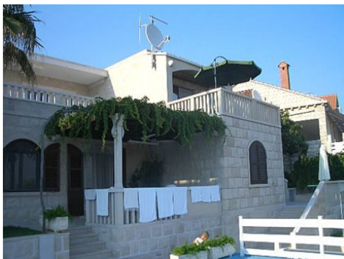
View from outside

All information is correct to the best of our knowledge. Errors and prior sale excepted. This prospectus is purely for information purposes. Only the notarized deed of sale is legally binding.