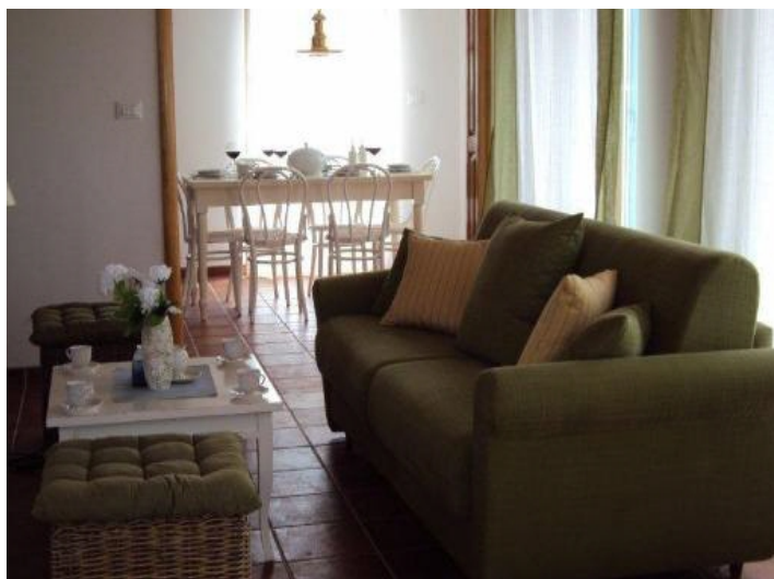
Alley to dining room