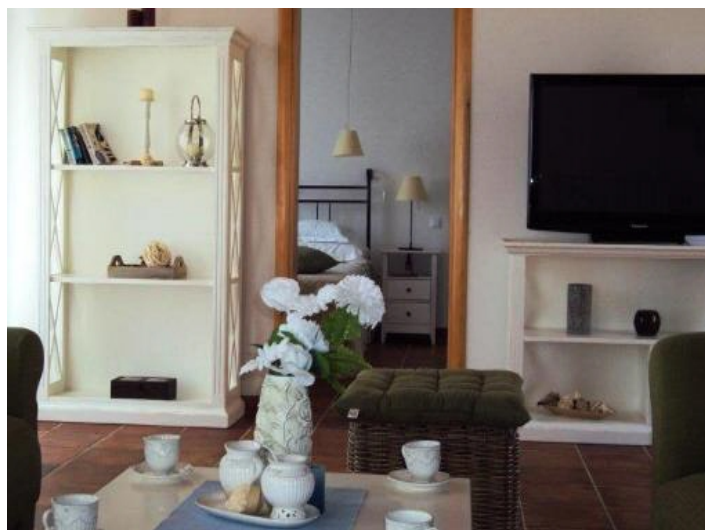
Alley to bedroom

All information is correct to the best of our knowledge. Errors and prior sale excepted. This prospectus is purely for information purposes. Only the notarized deed of sale is legally binding.