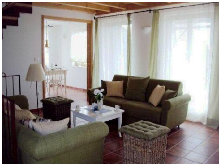
Living room with open ceiling beams