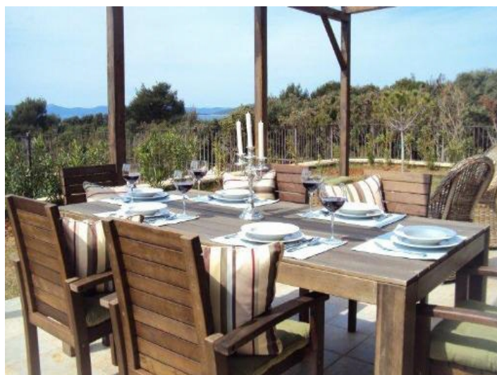
Pavilion with a sensational view