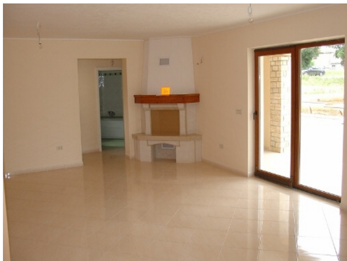
Bright living room with chimney