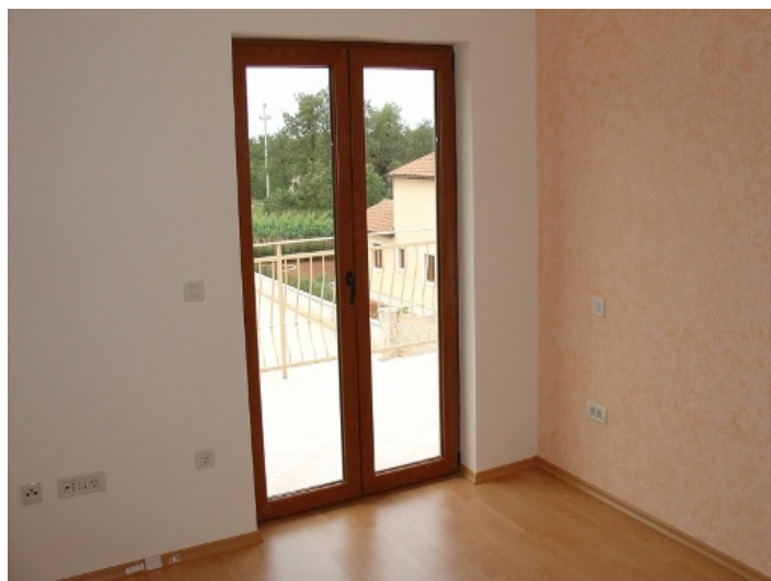
Door to balcony

All information is correct to the best of our knowledge. Errors and prior sale excepted. This prospectus is purely for information purposes. Only the notarized deed of sale is legally binding.