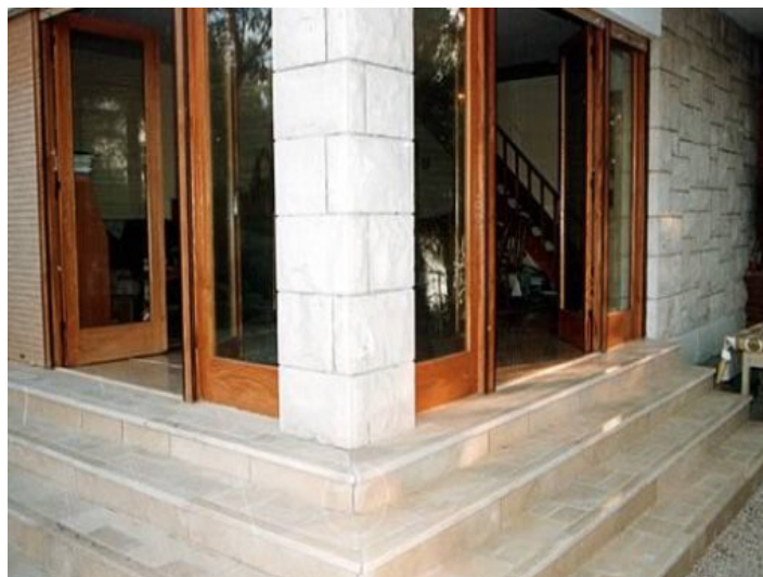
Door to the terrace