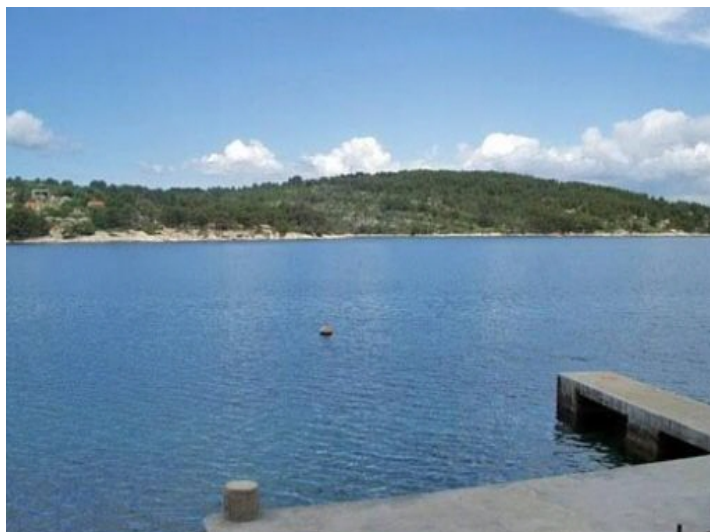
Great sea view