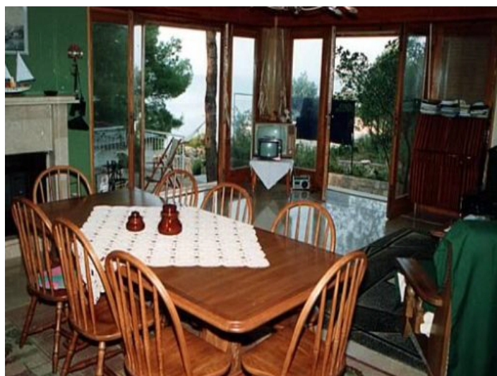
Cozy living room