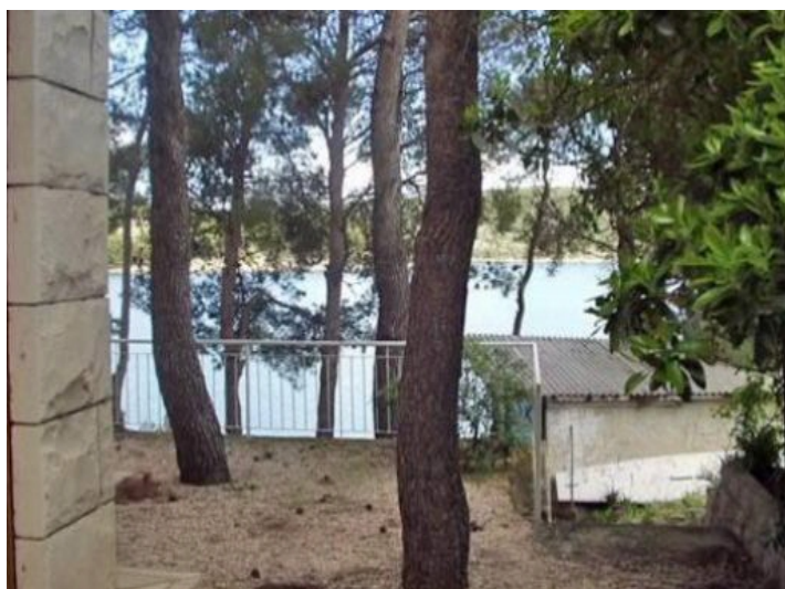
Surrounded by pine trees